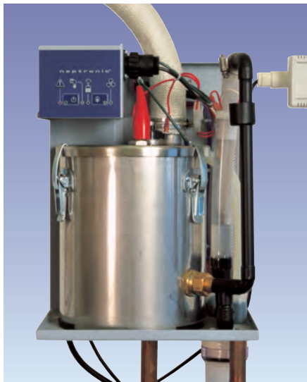
Easily accessed internal components for simple maintenance