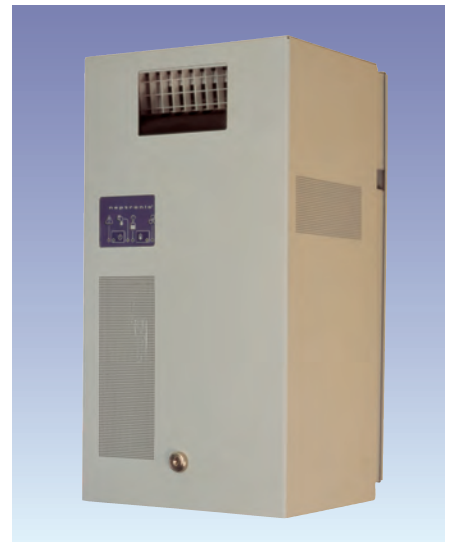
Also available – SKR in-room unit with built-in fan for steam dispersion

The Neptronic SKR is situated next to the duct with the steam pipe feeding steam into the air stream via the distribution manifold.