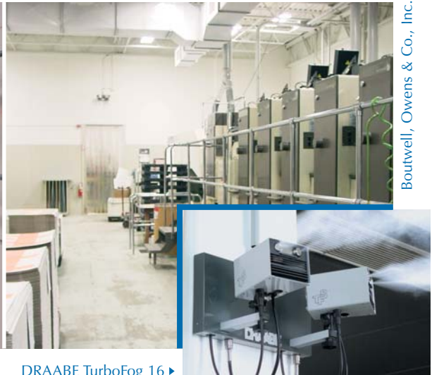
Boutwell, Owens & Co., Inc.